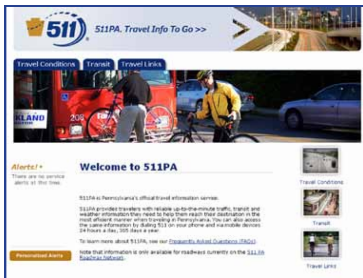
Figure 1. 511PA Web Site Home Page

Users may also set up free, personalized traveler alerts in order to receive customized traffic information based on their personal preferences.